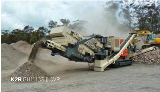
K2R GI1111CR | CVR